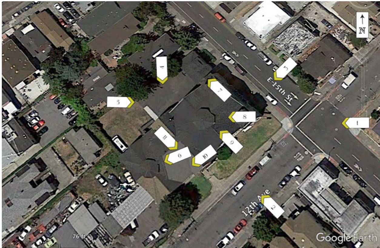
Figure 4. Photo Key