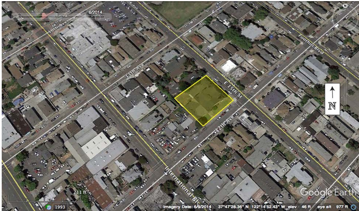
Figure 2. Site Map